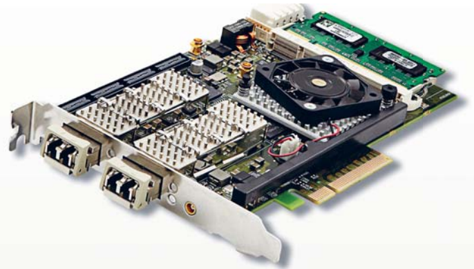
NT20E: 2 x 10 Gbps PCIe

The NT20E Capture Adapters provide deep packet inspection (DPI), flow analysis and protocol processing capabilities that can accelerate network applications and off-load the server CPU by taking care of layer 2 to 4 network traffic analysis. This enables OEM customers to build or upgrade their products to become high-performing full-line-rate 20 Gbps network monitoring/analysis systems by using the NT20E Capture Adapter and a standard Linux, FreeBSD or Windows server.