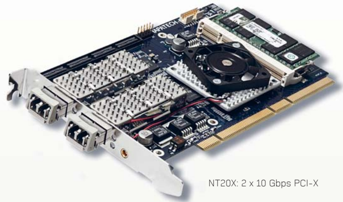
NT20X: 2 x 10 Gbps PCI-X