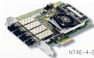
NT4E-4-STD: 4 x 1 Gbps PCIe

The 4 ports on the NT4E-STD Capture Adapters enable full-duplex monitoring of a network link (Rx and Tx traffic). The frame merging functionality enables Rx and Tx frames to be merged in reception time order simplifying the application processing.