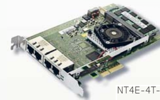
NT4E-4T-STD: 4 x 1 Gbps PCIe