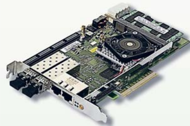
NT4E-2+2T: 4 x 1 Gbps PCIe