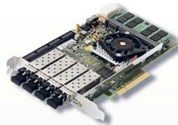
NT4E-4: 4 x 1 Gbps PCIe