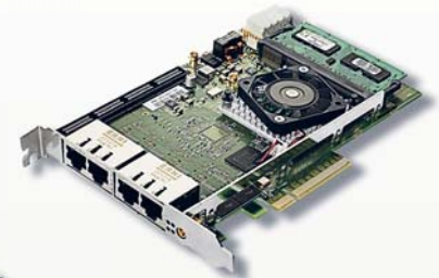
NT4E-4T: 4 x 1 Gbps PCIe